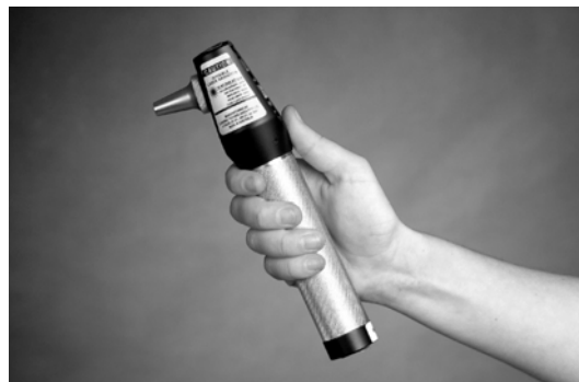
Low Level Laser

RianCorp, who manufacture low level laser therapy devices used in the treatment of lymphedema patients have partnered with the Dr. Vodder School to make them available in North America. This device has now been FDA approved and is being trialed by some of the Dr. Vodder therapists already. It has been researched and used extensively in Australia in lymphedema management. If you would like to find out more, please contact the Dr. Vodder School and we can provide more information. A press release is attached to this Therapy News RiancorpFDAnewsrelease.pdf . §