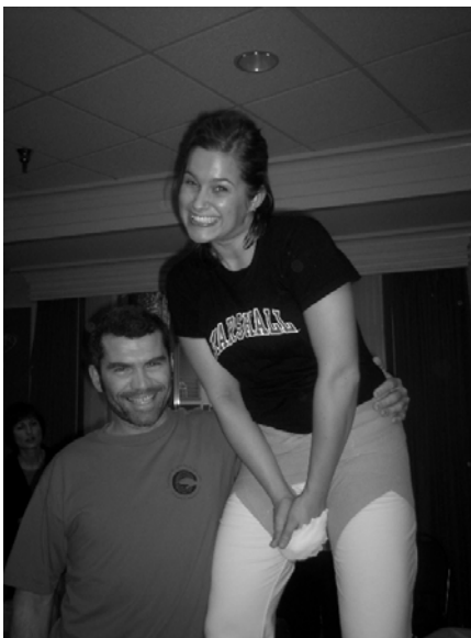
Having some fun at the Florida Review!!