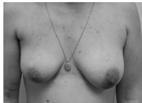
Changes in breast

I saw her monthly and performed a routine lymphoe-