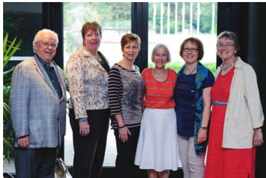
Canadian team at the ILF conference

The 4 th Conference of the International lymphedema Framework was attended by participants from 33 countries to hear about and discuss some of the latest position documents and clinical research. The position documents that were launched at this conference will soon be available on the ILF website ( www.lympho.org )